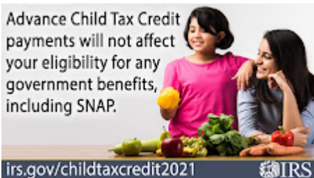
CTC2021 BenefitsSNAP.jpg 215K