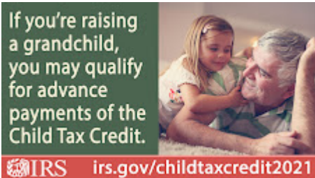
CTC2021 grandpa2.jpg 194K