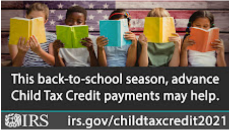
CTC2021 backtoschool3.jpg 211K