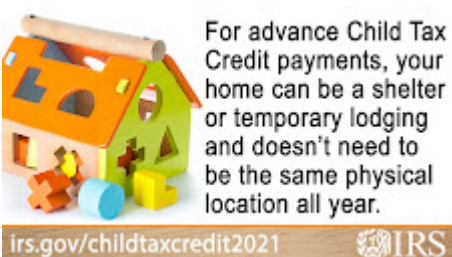
CTC2021register - home5.jpg 213K